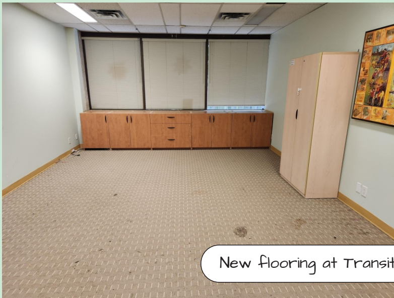
New flooring at Transitions Day Program