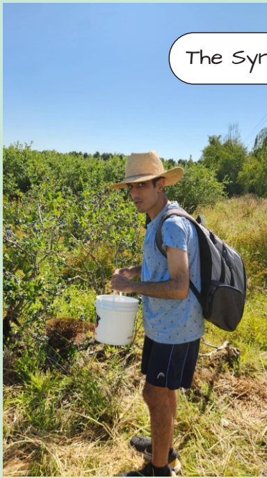
The Synergy Crew goes Blueberry Picking